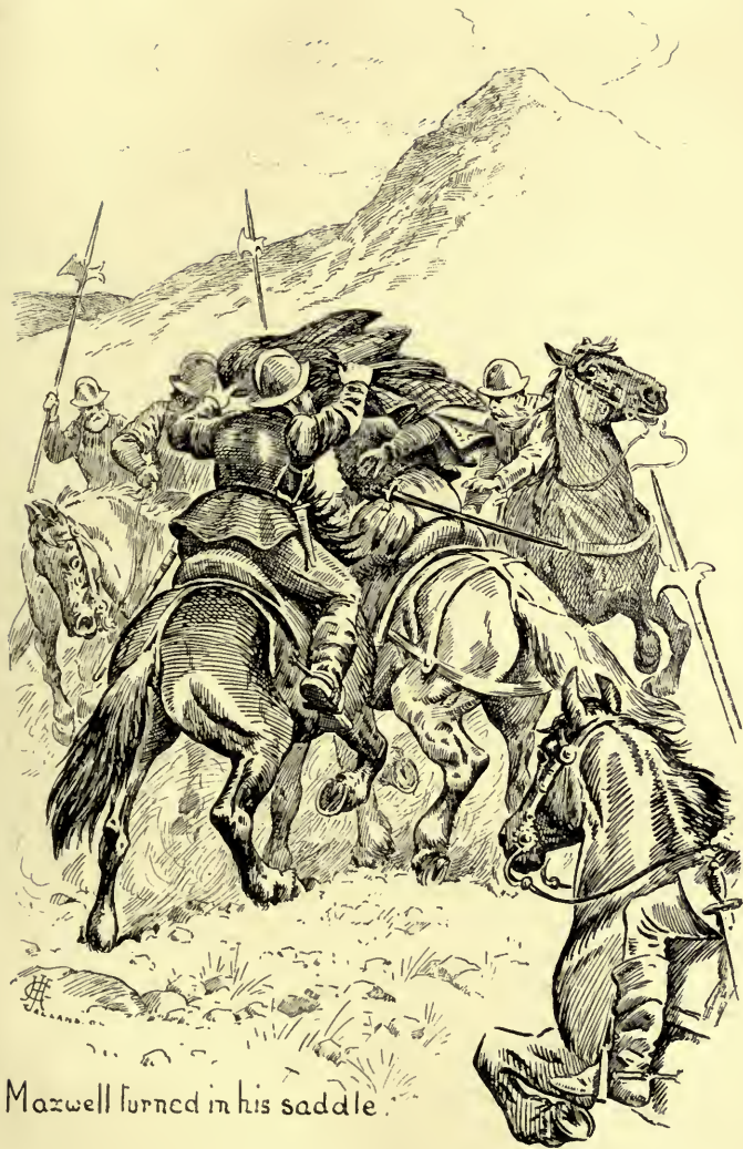
"Maxwell turned in his saddle."